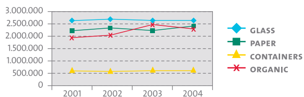
EVOLUTION OF DIFFERENT DIVISIONS OF THE SELECTIVE COLLECTION

YOU CAN HELP US TO IMPROVE THE RECYCLING OF WASTE BY SEPARATING YOUR PAPER AND CONTAINERS AND USING THE WASTE BINS THAT YOU FIND IN THE HOTELS OR APARTMENTS WHERE YOU ARE STAYING.