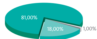
USES OF LAND IN CALVIÀ

also be added to this protected area, as well as the Red Natura 2000 of Cala Figuera and Galatzó which have a surface area of 1,017.45 hectares.